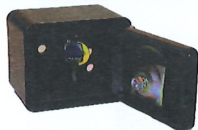
5000H Surface Mounted – Hinged Door