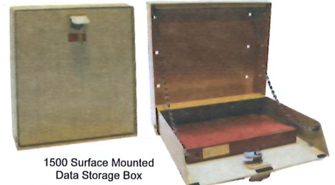
1500 Surface Mounted Data Storage Box