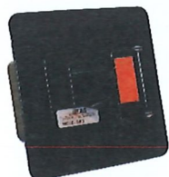
5000HR Recessed Mounted – Hinged Door