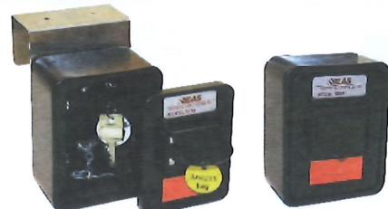
2500 DH Door Hung Mounted