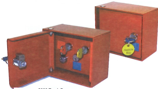
2800 Truck Box

Fire Department use only Apparatus key capture device